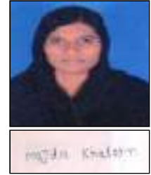
Photo and Signature

Gender : Female Student Category : General Program Type: UG Honours Subject : Geography University Exam Roll Number : 201240408052