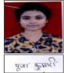
Photo and Signature

Gender : Female Student Category : BC Program Type: UG Honours Subject : Geography University Exam Roll Number : 201240408066