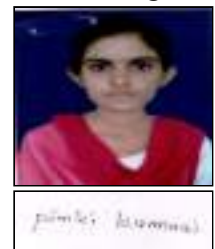
Photo and Signature

Gender : Female Student Category : BC Program Type: UG Honours Subject : Geography University Exam Roll Number : 201240408024