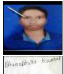
Photo and Signature

Gender : Male Student Category : EBC Program Type: UG Honours Subject : Geography University Exam Roll Number : 201240408086