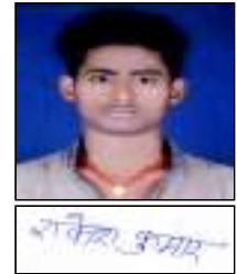
Photo and Signature

Gender : Male Student Category : EBC Program Type: UG Honours Subject : Geography University Exam Roll Number : 201240408076