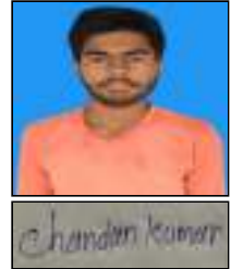
Photo and Signature

Gender : Male Student Category : BC Program Type: UG Honours Subject : Geography University Exam Roll Number : 201240408074