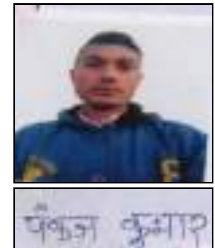
Photo and Signature

University Exam Roll Number : 201240408069