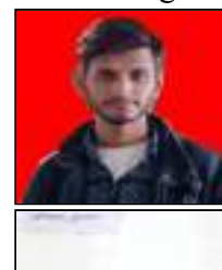
Photo and Signature

Gender : Male Student Category : General Program Type: UG Honours Subject : Geography University Exam Roll Number : 201240408130