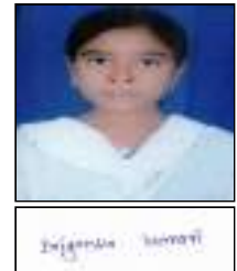
Photo and Signature

Gender : Female Student Category : BC Program Type: UG Honours Subject : Geography University Exam Roll Number : 201240408102