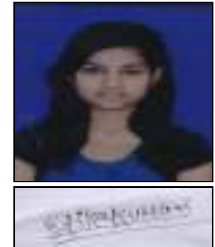
Photo and Signature

University Exam Roll Number : 201240408002