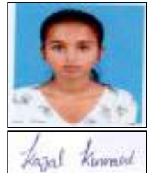
Photo and Signature

Gender : Female Student Category : EBC Program Type: UG Honours Subject : Geography University Exam Roll Number : 201240408075