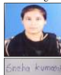
Photo and Signature

Gender : Female Student Category : EWS Program Type: UG Honours Subject : Geography University Exam Roll Number : 201240408091