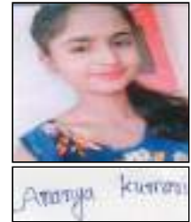
Photo and Signature

Gender : Female Student Category : General Program Type: UG Honours Subject : Geography University Exam Roll Number : 201240408013