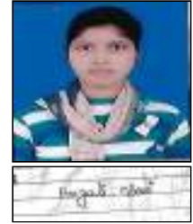
Photo and Signature

Gender : Female Student Category : SC Program Type: UG Honours Subject : Geography University Exam Roll Number : 201240408054