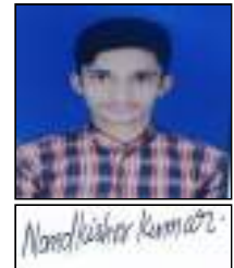
Photo and Signature

Gender : Male Student Category : EBC Program Type: UG Honours Subject : Geography University Exam Roll Number : 201240408065