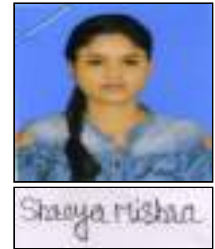
Photo and Signature

Gender : Female Student Category : General Program Type: UG Honours Subject : Geography University Exam Roll Number : 201240408117