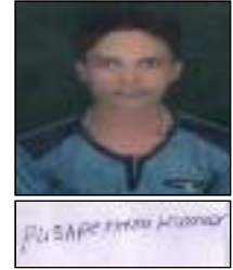
Photo and Signature

Gender : Male Student Category : EBC Program Type: UG Honours Subject : Geography University Exam Roll Number : 201240408047