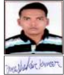
Photo and Signature

University Exam Roll Number : 201240408107