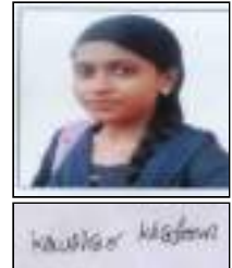
Photo and Signature

Gender : Female Student Category : EBC Program Type: UG Honours Subject : Geography University Exam Roll Number : 201240408113