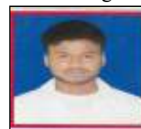
Photo and Signature

University Exam Roll Number : 201240408008